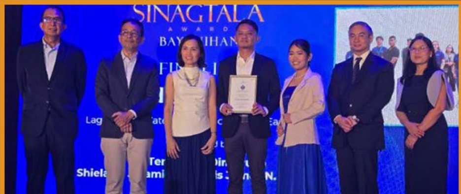
ROAD TO 940M AI TEAM SINAGTALA (BAYANIHAN) - FINALIST