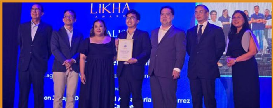
RADON TREATMENT SYSTEM TEAM LIKHA - FINALIST