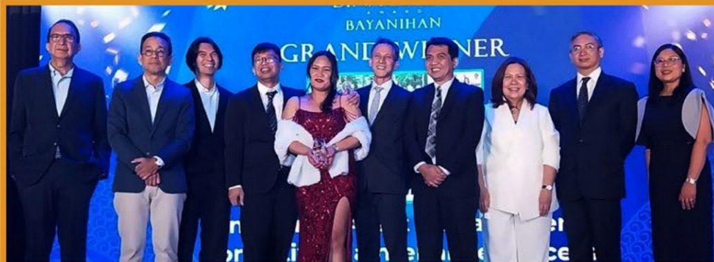
ENTERPRISE ASSET MANAGEMENT TEAM - CORRECTIVE MAINTENANCE PROCESS SINAGTALA (BAYANIHAN) - GRAND WINNER